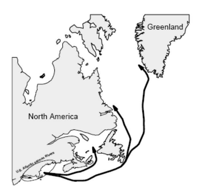
Figure 11-2. Marine Migration Routes of US-Origin Atlantic Salmon. 41

After the seven-inch salmon smolts leave the rivers, they spend from one to three winters in the North Atlantic Ocean feeding in the rich waters off the coasts of Labrador, Newfoundland, and Greenland.<sup>42</sup> Maine salmon have been found in waters as far away as the Faroe Islands