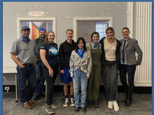
Student volunteers pose at the EqualityMaine offices.

On September 20 1L students were invited to participate in the 2nd Annual Day of Service as part of their Orientation+ programming. Students could choose among seven different volunteer opportunities in Portland assisting local organizations. This year's partner organizations were: Volunteer Lawyers Project , Maine State Archives , Ronald McDonald House , Portland Trails , Presumpscot Land Trust , Maine Needs , and EqualityMaine . Eighty-three 1L students participated - and we couldn't be more proud of the work they did!