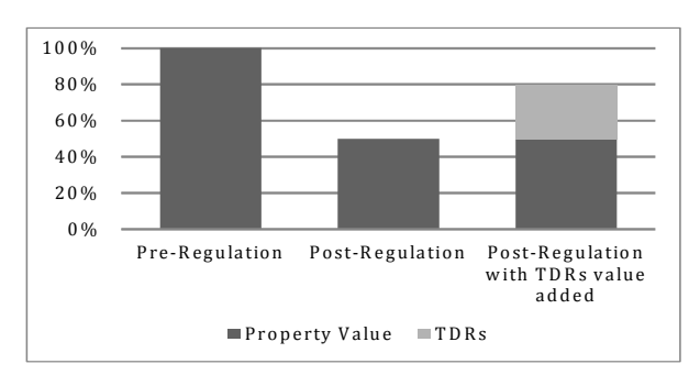
III. INTO THE MAZE: DEBATING TDRS' ROLE IN THE TAKINGS VALIDITY BALANCE

in reducing government liability. The graphic below depicts how TDRs allow regulated landowners to recover this lost value.